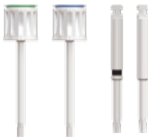
1.2, 1.25 Hex Driver